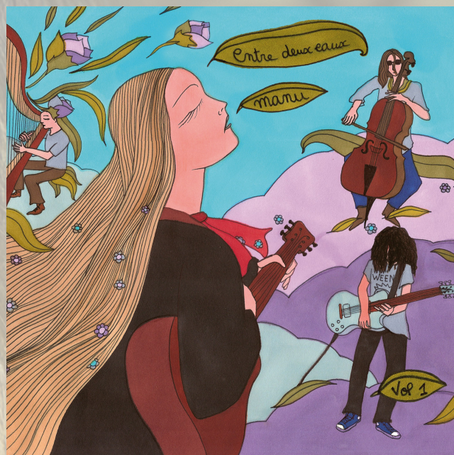
© Cover art by Faustine Ferrer

À quelqu'un / Amoureux / Encore de moi / Comme un gant / Juste une chance / Je pense à toi / Un baiser dans le cou / La dernière étoile / Talk (About) / À toute vitesse / Amaku Ochiru / La routine / Je pars avant.